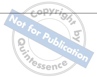
Table 4 Smile line in relation to lower lip.