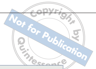
Table 1 Databases and results of the literature search.