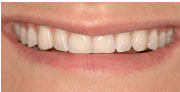
Fig 5 Flat smile line.