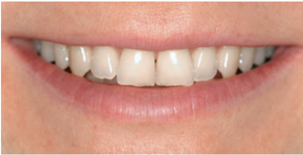
Fig 1 Average smile line.