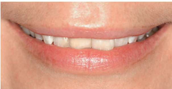
Fig 3 Low smile line.