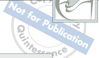
Table 5 Smile evaluation.