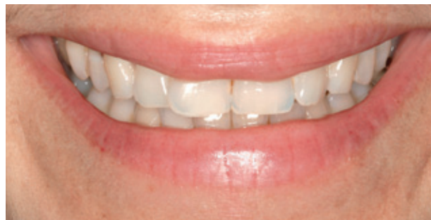
Fig 4 Parallel smile line.