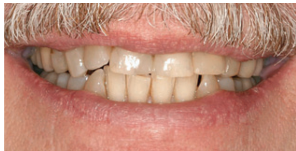
Fig 6 Reverse smile line.