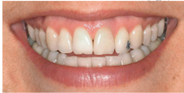
Fig 2 High smile line.