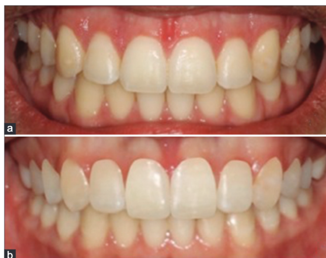
Figure 3: (a) One hundred and eight days postsurgical; (b) digital smile simulation.

The DSD enables a more complete treatment plan and concentrates on the development of the anatomical features within the given parameters. It makes it possible to view the results of the patient, demonstrating the severity of the case, treatment strategies, prognosis and recommendations, facilitating acceptance or modification. The aim of this strategy is the discussion of the case with the patient, which must be carried out according to their expectations and the feasibility of implementation. The treatment plan was shown to the patient, which met their wishes, was approved and did not require modifications. [4,8]