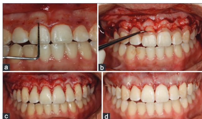
Figure 2: (a) Digital smile simulation; (b) probing and marking of points; (c) flap detachment beyond the mucogingival junction; (d) removal of the gingival band and observation of the relationship between the bone crest and cemento-enamel junction.

Studies have reported the use of the golden ratio to establish the optimal dental composition, assisting in esthetic smile planning and establishing harmony. On the other hand, there is evidence that the use of the golden ratio between the mesial-distal widths of the upper anterior teeth should not be considered as a valid method to ensure a beautiful smile, and the dental esthetics should not be based mathematically. Esthetics are subjective and depend, in addition to the proportion of factors, the cultural characteristics, gender, body type, and age of the patient. Therefore, a personalized treatment plan and the esthetic planning of the smile are important. [5]