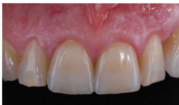
Figure 1b: Postoperative appearance demonstrates optimal emergence profiles and significantly improved aesthetic ratios.

crown, the underlying dentin, the root, and the gingival margin, all-ceramic restorations would allow natural shade transmission to the gingiva in this key area for the final aesthetic outcome.