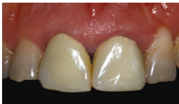
Figure 1a: Preoperative view. Note the incorrect width-to-length ration and unaesthetic soft tissue integration.

Metal-free restorations were selected to enhance the light dynamics of the crown, but also of the gingival margin area. By providing ideal light circulation among the cervical of the