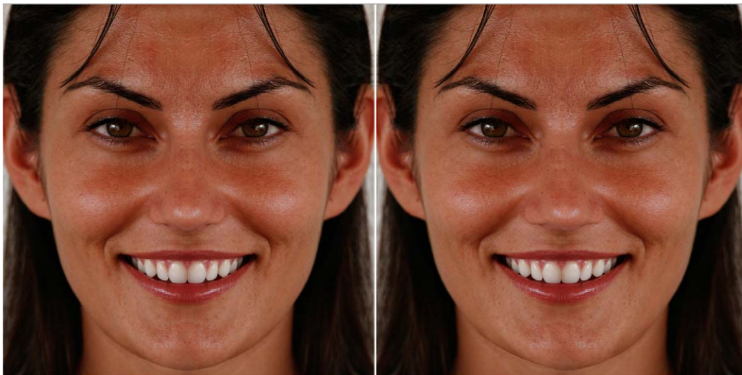
FIGURE 1 Symmetrical facial model—control picture (left), Asymmetrical facial model (right)

The dental midline is defined by the contact surface between the two central incisors and is considered one of the most important esthetic factors in the positioning of the anterior teeth 1–3 because it defines the maxilla's plane of symmetry, which is considered one of the most critical elements of a beautiful smile. 4–6 Additionally, a properly placed dental midline maximizes a smile's harmony with the overall face and thus is a common starting point in esthetic and orthodontic diagnosis. 6,7