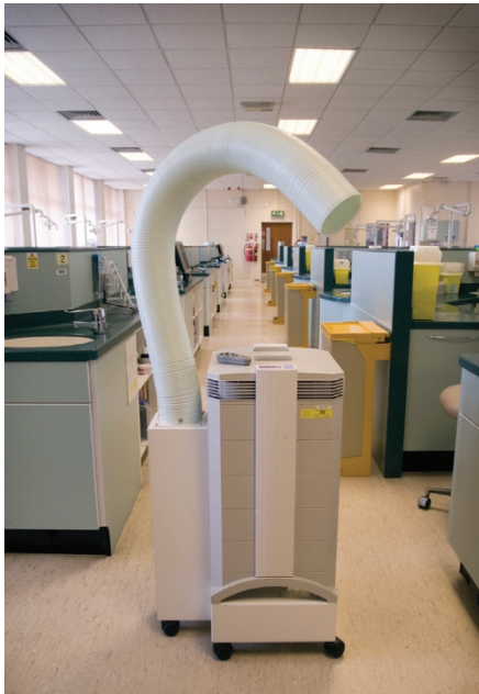
Fig. 1 The IQAir: FlexVac™ air cleaning system used in this study

IQAir: FlexVac™ equipment. The IQAir system (Fig. 1) comprises a 1,500 mm long flexible polypropylene plastic suction duct (125 mm diameter) that firstly directs air through a combination of High Efficiency Particulate Air (HEPA) pre-filters which retain particles less than 0.3 \mu\text{m} in size (which includes bacteria and many types of virus). A second filtration stage involves four cylinder gas filter cartridges, which remove mercury vapour, formaldehyde, glutaraldehyde and odours. The final filtration stage comprises of an electrostatically charged post-filter.